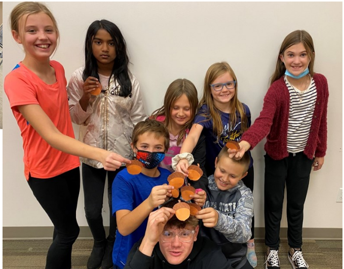
Kids of God showing off an activity