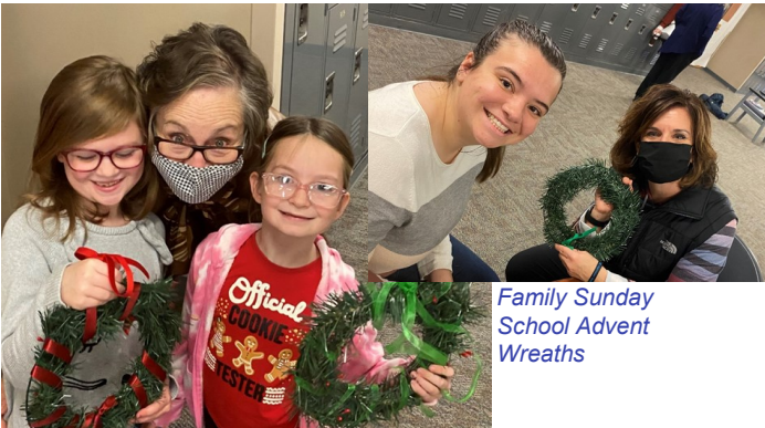
Family Sunday School Advent Wreaths

The theme of service and giving for Jesus will continue through December. Youth Group students chose to partner with Waukee Area Christian Services' Blessing Tree to provide Christmas gifts for four area children. Students will be fundraising, shopping, and organizing the gifts. You can support them at the bake sale before and after worship on December 5th! Both Kids of God and Youth Group will also celebrate Jesus' birthday in style to close out the 2021 year.